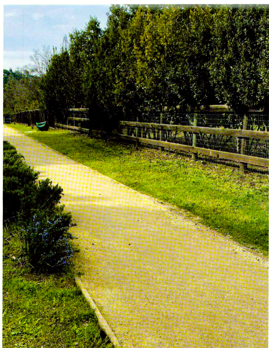
Fremont Road, On Road Path

To report a maintenance issue with trails, scan the QR code