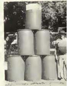
Pictured above is Dan Alexander standing next to the amount of water used by a single LAH household every day—325 gallons a day per person? Really?!