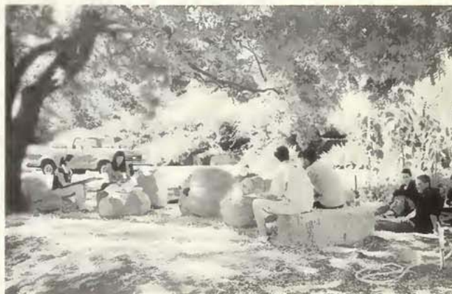
Painted pumpkins are art students from Susan Burchow's Basic Drawing class at BHS.