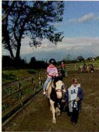
The Westwind Barn which is a community asset provides a year-around riding program