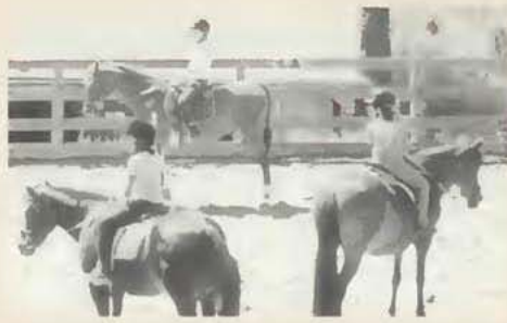
Student riders perform new skills at a Ring Show following a weeks Horsemanship Class.

winner. The program's capacity of 14 students left another 10-15 on a waiting list that it was unable to accommodate. Next year the Recreation & Parks Committee will try to get the Pony Club to sponsor a second session. The age level accepted was 7-17.